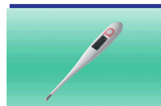
Thermometers are a type of sensor commonly used in health care.

Many different types of sensors are already used in health care, including self-care at home. Thermometers translate the expansion of a fluid or bending of a metal strip in response to heat into a number corresponding to body temperature. Paper-based home pregnancy tests contain a substance that changes color in the presence of hormones indicating pregnancy. In hospitals and other provider-based settings, you can find more complex types of sensors like pulse oximeters (also known as blood-oxygen monitors), which measure changes in the body’s absorption of special types of light to provide information on a patient’s heart rate and the amount of oxygen in the blood.