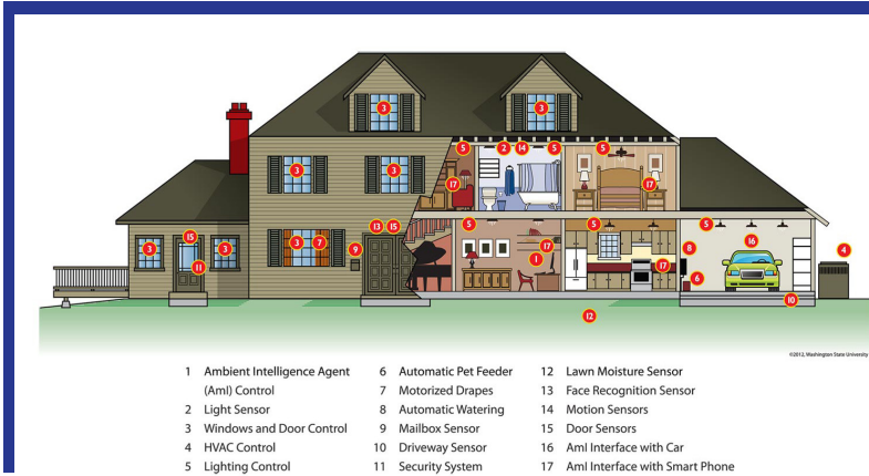
Illustration of a "smart home" showing some types of environmental sensors that can be useful for daily life.

Many illnesses develop and progress as a result of faulty regulation or dysfunction of a range of hormones, neurotransmitters, or other important body chemicals. Tracking such chemical activity is key to unraveling disease processes. NIBIB-funded researchers seek to improve on biosensors in a variety of ways, such as creating novel types of coatings that improve sensor sensitivity, selectivity, and stability; and developing a fluorescence-based strategy to detect proteins in living organisms and in real time.