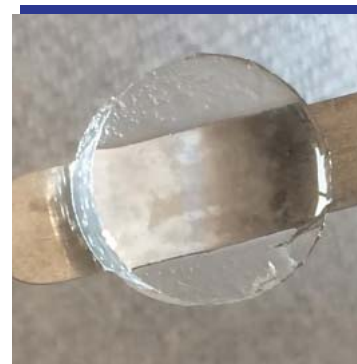
Hydrogel sealants may allow pain-free dressing changes for patients with burns. Grinstaff lab, Boston University