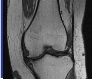
MRI of a knee

MRIs employ powerful magnets which produce a strong magnetic field that forces protons in the body to align with that field. When a radiofrequency