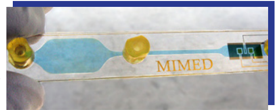
The MIMED system is a universal point-of-care pathogen detection system. The 6x1 cm disposable chip integrates sample preparation and sequence-specific detection and can identify microbes in unprocessed biological, water, food, and forensic samples.

Some of the challenges to sensor research include simplifying and automating the preparation of patient samples to be used at the point-of-care and overcoming the body's natural rejection response to implantable or minimally invasive sensors.