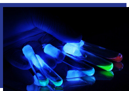
Test tubes containing purified proteins made to fluoresce in different colors.

While many advanced sensors aren’t practical for routine medical care, they allow researchers to study the basic foundations of disease in more detail than previously possible, and to develop new technologies that could dramatically improve the quality of life of people with severe disabilities.