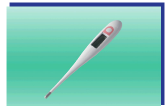
Thermometers are a type of sensor commonly used in health care.

Many different types of sensors are already used in health care, including self-care at home. Thermometers translate the expansion of a fluid or bending of a metal strip in response to heat into a number corresponding to body temperature. Paper-based home pregnancy tests contain a substance that changes color in the presence of hormones indicating pregnancy. In hospitals and other provider-based settings, you can find more complex types of sensors like pulse oximeters (also known as blood-oxygen monitors), which measure changes in the body’s absorption of special types of light to provide information on a patient’s heart rate and the amount of oxygen in the blood.