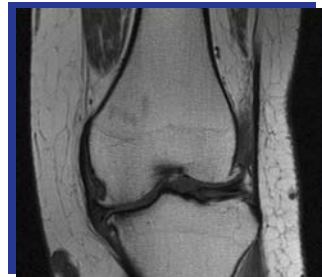
MRI of a knee

MRIs employ powerful magnets which produce a strong magnetic field that forces protons in the body to align with that field. When a radiofrequency current is then pulsed through the patient, the protons are stimulated, and spin out of equilibrium, straining against the pull of the magnetic field. When the radiofrequency field is turned off, the MRI sensors are able to detect the energy released as the protons realign with the magnetic field. The time it takes for the protons to realign with the magnetic field, as well as the amount of energy released, changes depending on the environment and the chemical nature of the molecules. Physicians are able to tell the difference between various types of tissues based on these magnetic properties.