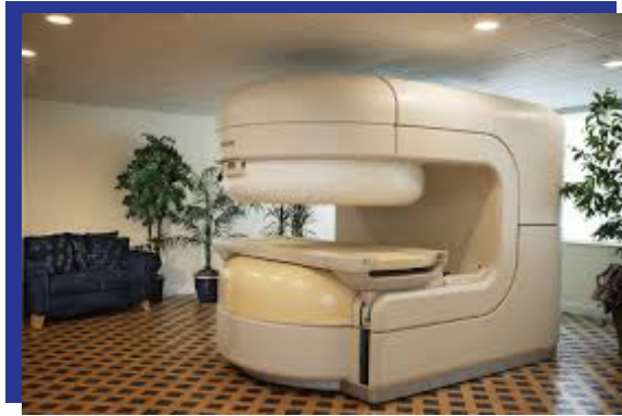
New open MRI machine

Chronic liver disease and cirrhosis affect more than 5.5 million people in the United States. NIBIB-funded researchers have developed a method to turn sound waves into images of the liver, which provides a new non-invasive, pain-free approach to find tumors or tissue damaged by liver disease. The Magnetic Resonance Elastography (MRE) device is placed over the liver of the patient before he enters the MRI machine. It then pulses sound waves through the liver, which the MRI is able to detect and use to determine the density and health of the liver tissue. This technique is safer and more comfortable for the patient as well as being less expensive than a traditional biopsy. Since MRE is able to recognize very slight differences in tissue density, there is the potential that it could also be used to detect cancer.