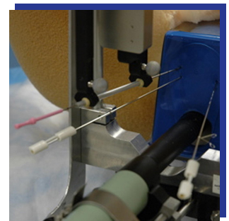
Ultrasound-guided robotic prostate surgery

Ablation techniques for early cancers: Patients with early kidney cancer can be treated with minimally invasive procedures to destroy small tumors. Cryoablation uses cold energy to destroy the tumors. Doctors use computed tomography (CT) and ultrasound imaging to position a needle-like probe within each kidney tumor. Once in position, the tip of the probe is super-cooled to encase the tumor in a ball of ice. Alternate freeze/thaw cycles kill the tumor cells. Other minimally invasive methods of destroying early kidney cancers include heating the tumor cells, and surgical removal using a robotic device. Many patients can go home the same day and are able to perform regular activities in several days.