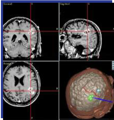
Images help target exact site of intervention

Robotics: The surgeon's hands and traditional surgical tools are too large for small incisions. Instead, thin, finger-like robotic tools are used to perform the surgery. As the surgeon watches the image on the screen, she uses a tele-manipulator to transmit and direct hand and finger movements to a robot, which can be controlled by hydraulic, electronic, or mechanical means.