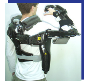
RUPERT: a device for robotic upper extremity repetitive therapy.