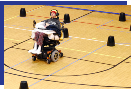
A man guides his wheelchair around an obstacle course using the tongue magnet and headset system.

Wireless Tongue Drive System for Paralyzed Patients: NIBIB-funded researchers are developing an assistive technology called the Tongue Drive System (TDS). The core TDS technology exploits the fact that even individuals with severe paralysis that impairs limb movement, breathing, and speech can still move their tongue. Simple tongue movements send commands to the computer allowing users to steer their wheelchairs, operate their computers, and generally control their environment in an independent fashion.