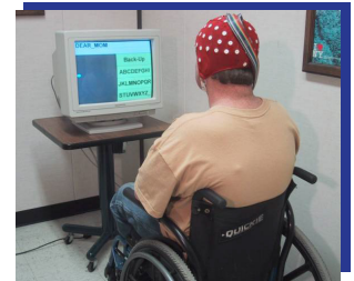
An individual writes sentences with his thoughts using a brain-computer interface system.

Rehabilitation engineers also develop and improve rehabilitation methods used by individuals to regain functions lost due to disease or injury, such as limb (arm and or leg) mobility following a stroke or a joint replacement.