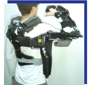
RUPERT: a device for robotic upper extremity repetitive therapy.