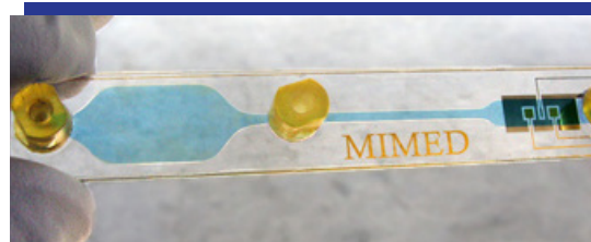
The MIMED system is a universal point-of-care pathogen detection system. The 6x1 cm disposable chip integrates sample preparation and sequence-specific detection and can identify microbes in unprocessed biological, water, food, and forensic samples.

Some of the challenges to sensor research include simplifying and automating the preparation of patient samples to be used at the point-of-care and overcoming the body's natural rejection response to implantable or minimally invasive sensors.