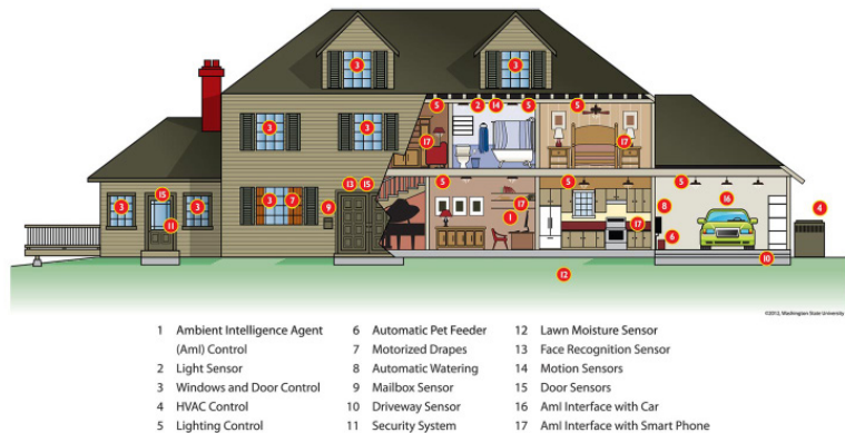
Illustration of a "smart home" showing some types of environmental sensors that can be useful for daily life.

Many illnesses develop and progress as a result of faulty regulation or dysfunction of a range of hormones, neurotransmitters, or other important body chemicals. Tracking such chemical activity is key to unraveling disease processes. NIBIB-funded researchers seek to improve on biosensors in a variety of ways, such as creating novel types of coatings that improve sensor sensitivity, selectivity, and stability; and developing a fluorescence-based strategy to detect proteins in living organisms and in real time.