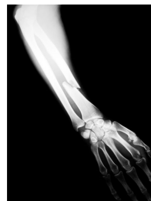
X-ray of broken arm.

By capturing 30 images every second, this technique would have 10 to 100 times the temporal resolution of conventional tomosynthesis, resulting in “sharper” images of tissues in motion (similar to using a faster shutter speed on a camera). The researchers plan to evaluate the use of SFXT in the detection of cardiovascular disease — by looking at calcium deposits in the coronary arteries — and to guide radiation treatment to precise locations in the lungs, which would enable safer